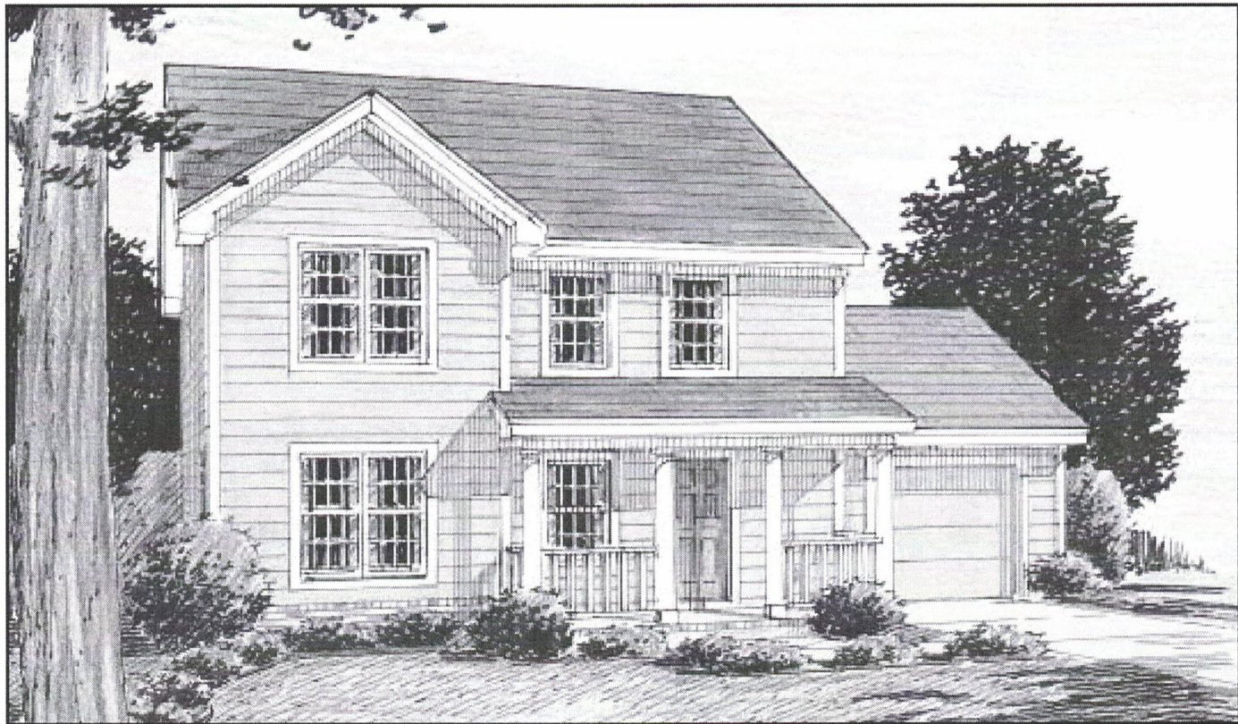
Renderings are for illustration purposes only and may vary in precise detail from plans and specifications.

The quaintness of Ultima T-10 A. A sizable covered front porch for quiet reflection. Nice-sized living and dining rooms enhance today's lifestyles. Upstairs, the three bedrooms are served by two full baths.